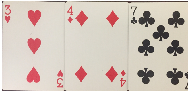
Example for step #15

Cognitive Skill: visual working memory, visual & auditory processing, spatial reasoning