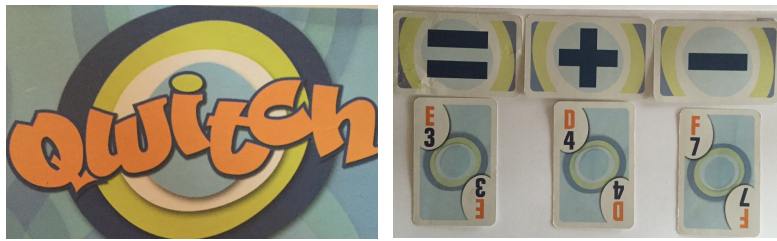
Example for step #12

Cognitive Skill: visual memory, long term memory, auditory and visual processing,