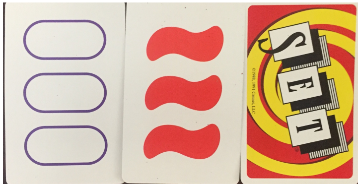
Example for #14

Cognitive Skill: visual memory, long term memory, auditory and visual processing, logic and reasoning